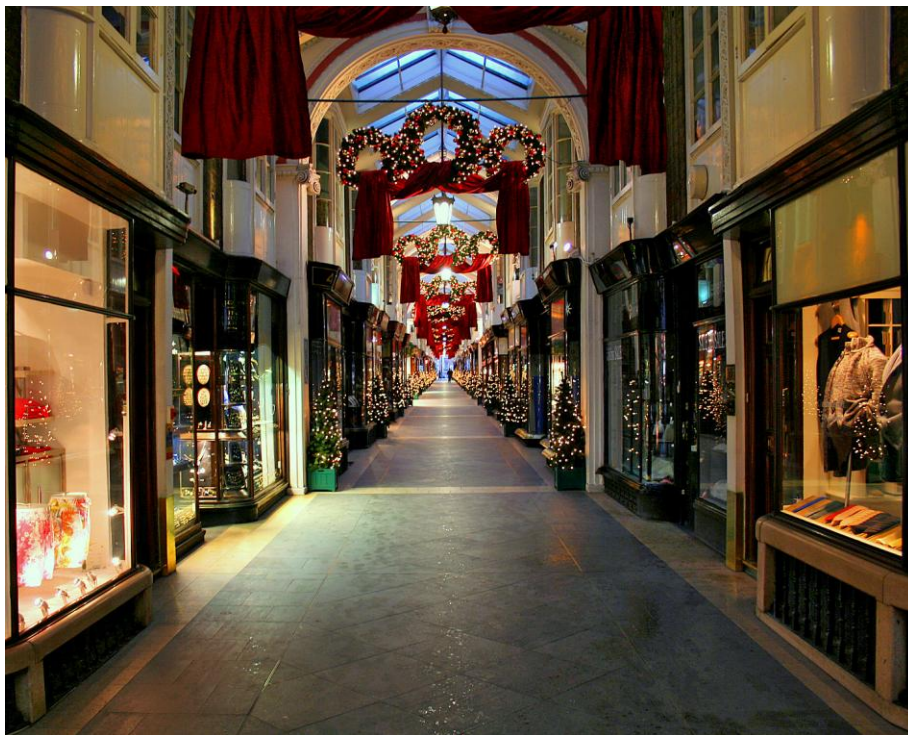
DAYS 1-2: Holiday shopping in London

Make your way to Napoléon's Arc de Triomphe , which looms over the city's craziest rotary. View its glorious sculptures and the Tomb of the Unknown Soldier. You may want to ascend to the top for a superb panorama of the city and a visit of the museum housed inside the monument.